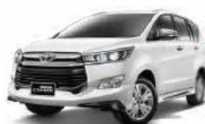
INNOVA / CRYSTA